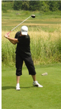
Great Body Form

Can my body perform more effectively? Can I increase my strength, balance and flexibility?