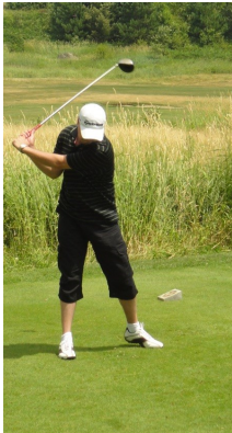
Great Body Form

Can my body perform more effectively? Can I increase my strength, balance and flexibility?