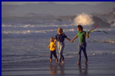
IMPAKing Quality of Life

In short, the primary purpose of the IMPAK mouth guard system is to improve your quality of life. The IMPAK mouth guard reduces the negative impact that misaligned teeth and jaws can have on your body. It reduces stress on your spine to promote good posture, balance, and strength. A properly aligned body is less prone to injuries. And the IMPAK guard does it naturally!