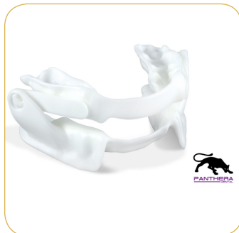
The Panthera D-SAD