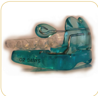
The O2 Oasys Oral/ Nasal Airway System