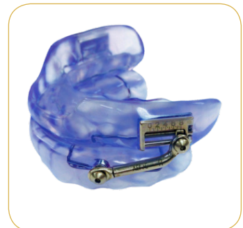
SomnoDent Herbst Advance®