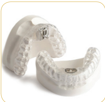
Thornton Adjustable Positioner – TAP III®