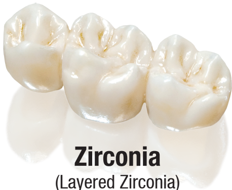
Zirconia (Layered Zirconia) Crowns & Bridges

NobelProcera™ | IPS e.max® | Porcelain Bonded to Titanium Custom Shading & Staining | Zirconia | CeltraPress | GC Liese