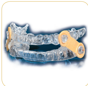
EMA® Appliance (Elastic Mandibular Advancement)