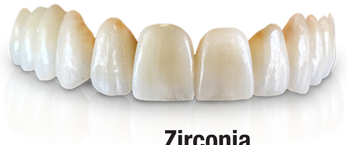
Zirconia (Full Contour) Crowns & Bridges