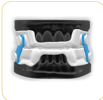
DDS0™ (Diamond Digital Sleep Orthotic)