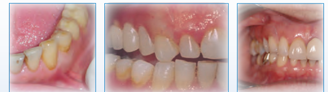
Valplast® is made from a translucent nylon material that blends in with your natural gum tissues to become virtually invisible when placed in the mouth.

Millions of patients have already discovered the benefits of wearing a Valplast Flexible Partial. Ask your dentist about Valplast today!