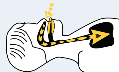
TAP 3 Elite maintains forward jaw position and keeps the AIRWAY OPEN!!!