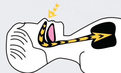
Normal jaw position, airway open.