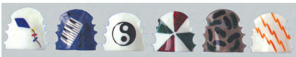
13. Kite 14. Piano Keys 15. Ying-Yang 16. Neon Pin Wheel 17. Camouflage 18. Lightning