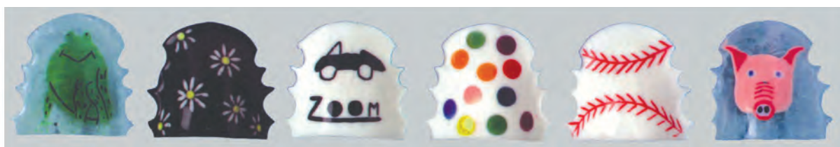
25. Frog 26. Black Daisy 27. Racing Car 28. Life Saver 29. Baseball 30. Pink Pig