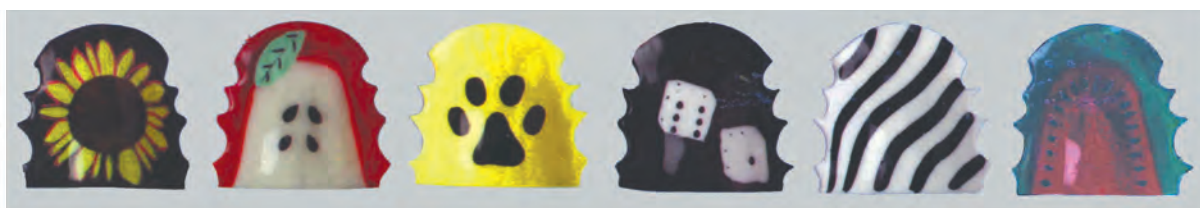
19. Black Sunflower 20. Apple Seed 21. Tiger Claw 22. Dice 23. Zebra Stripes 24. Watermelon