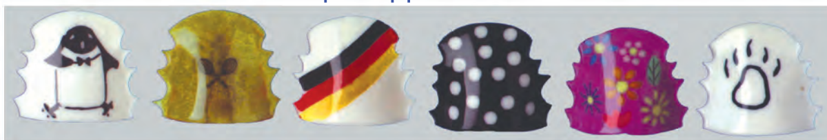
1. Penguin 2. Tennis Racket 3. Racing Stripes 4. White Dots 5. Floral Design 6. Bear Claw