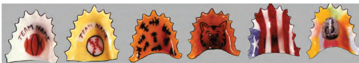
55. Basket Ball