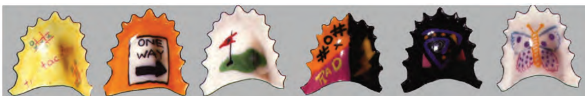
67. Tic Tac Toe