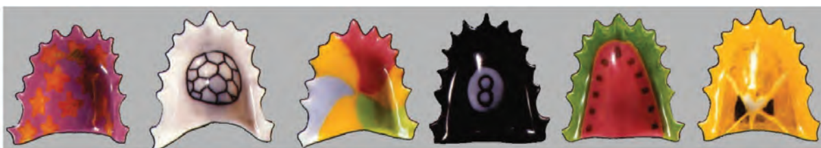
49. Glitter Star