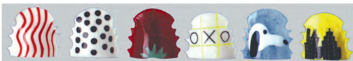
7. Red Stripes 8. Black Dots 9. Strawberry 10. X O X 11. Snoopy 12. New York