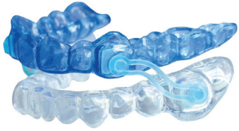
SilentNite® /Silensor S/L