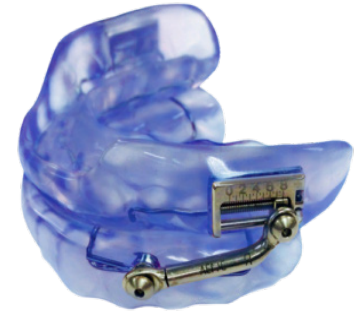
SomnoDent Herbst Advance®

SomnoDent® oral devices are clinically proven, safe, and FDA cleared for mild to moderate obstructive sleep apnea (OSA). As a mandibular advancement splint (MAS), the SomnoDent® oral devices function by comfortably positioning the patient’s mandibular forward, clearing the obstructed airway.