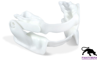
The Panthera D-SAD