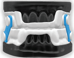
DDSO™ (Diamond Digital Sleep Orthotic)