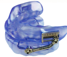
SomnoDent Herbst Advance®