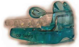
The O2 Oasys Oral/ Nasal Airway System