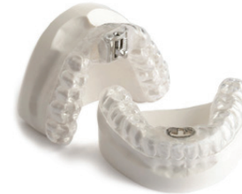
Thornton Adjustable Positioner – TAP III®