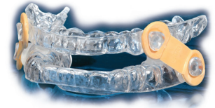
EMA® Appliance (Elastic Mandibular Advancement)

When Quality Counts.. You Can Rest Assured